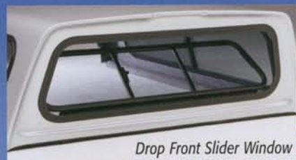
Drop Front Slider Window