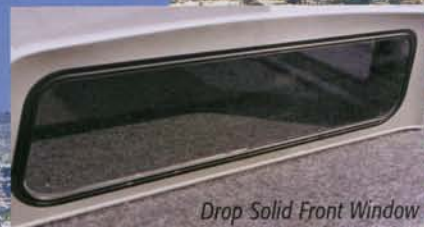
Drop Solid Front Window